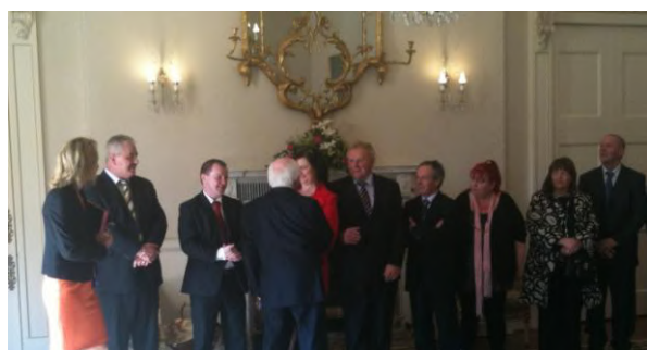
Right of Place members meeting President Higgins

An important element of the Programme is to support networking and learning among organisations so good practice can be developed in working with survivors of institutional abuse across a range of areas.