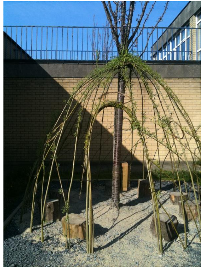
Improvements to grounds of OLI Junior School, Darndale

Darndale Belcamp Oblate Grant Scheme – funded by the Oblate Congregation. 2011 was the sixth year of a ten-year programme in this area of Dublin 17. €107,500 was given in grants to 23 organisations, projects and initiatives. This is an annual fund with a deadline in February each year. For the remaining four years of the Grant Scheme, the value of grants available will be €50,000 per annum.